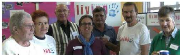
Another great day at the Northern Suburb Community House! April 1 2009